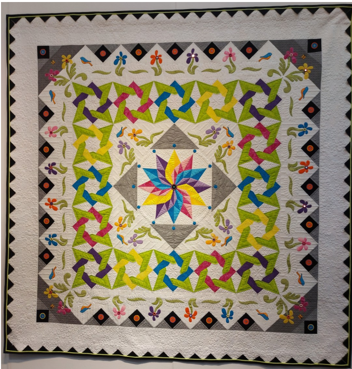
Best in Show FoQ 2025 by Simon Steuxner Twisted (Traditional)

Thanks to everyone who contributed to our August workshop hosted by The Little Shop of Fabrics in Smarden. We have two more Project Linus workshops planned for 2025, Friday 10 October , and Saturday 13 December . The workshop days are free of charge and tea and coffee will be available too. We will be cutting, sewing, and binding quilts throughout the day. No experience is necessary just a willingness to take part. To keep track of people coming, please book your space via https://www.littleshopoffabrics.co.uk/courses As we head into the colder months, we need larger quilts and quilts suitable for boys or gender-neutral quilts. Thank you to everyone who donated Christmas and other fabrics. We have been busy making scrappy quilts. If you would like to donate fabric or unfinished quilt blocks or quilts, we would be happy to receive them. Daisy Rudnick, who runs the Project Linus table at the Oast Quilters meetings will happily collect any donations on our behalf. Alternatively, you can contact one of your local Project Linus Area Coordinators: Thank you for continuing to support Project Linus – Project Linus Kent and Medway Area Coordinators: Lou Matthews, East Kent, 07938537375 or louisemathews5@icloud.com Michelle Hogben, Ashford, and surrounding area, 07706 582662 or shellhogben2004@hotmail.com Christine Gainsford, Medway and North Kent area, 07931 294836 or Christine.carey61@gmail.com